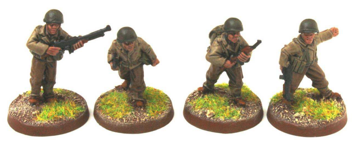
Crusader figures painted by Mick Farnworth